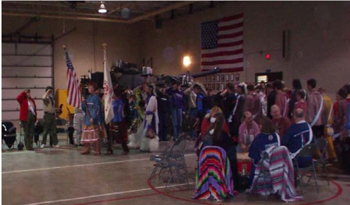
Grand Entry and presenting the Colors