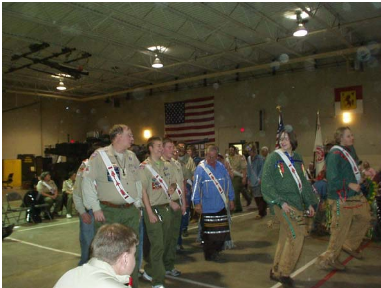
All Arrowmen enjoy participating at Pow Wow