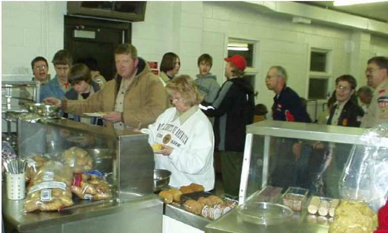
Crackerbarrell a good time for fun and fellowship