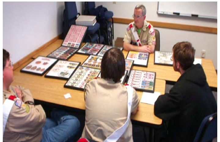
Discussing lodge patch history