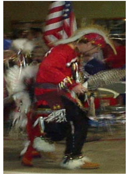
MITIGWA DANCERS perform at Pow Wow