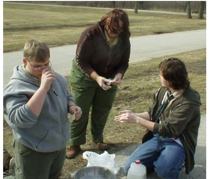
and how to make fry bread