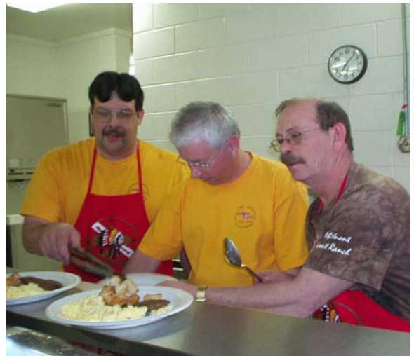
Cheerful service for breakfast at 7am