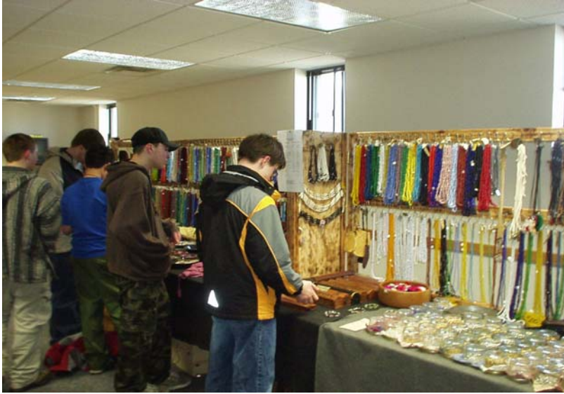
THREE EAGLES TRADING POST has a good supply of beads and other items