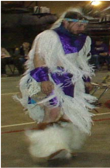
Everyone enjoys dancing at Pow Wow