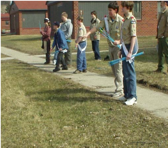
Arrowmen learn an Indian game