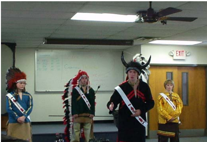
Ceremony team tryouts and chapter team evaluations