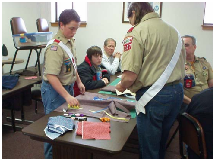
Making an outfit to wear to Pow Wow