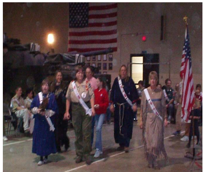
Ladies only dance