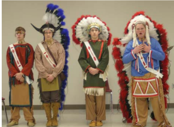
Golden Eagle Ceremony Team