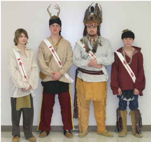
Bo Qui Ceremony Team