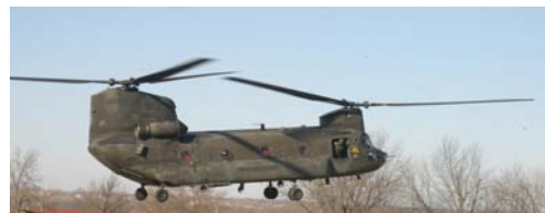
Arriving for the Pow Wow