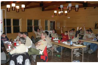
Who knows the answer?