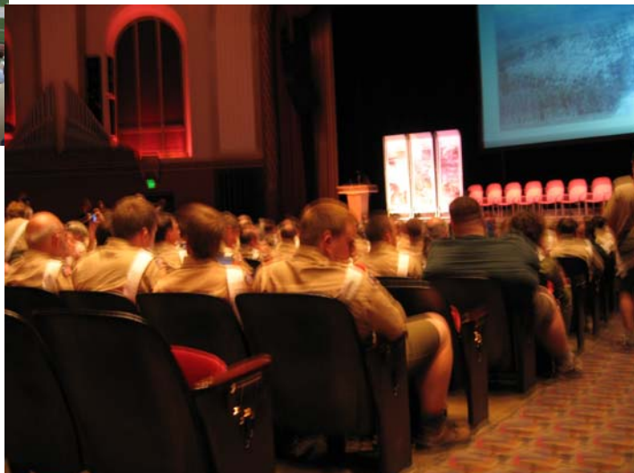
(right) Kick off presentation at the Nation Conservation and Leadership Summit for Arrowcorps 5 a Nation Order of the Arrow Service Project to be conducted in 2008. 5 sites, 5 weeks, 5 thousand arrowmen.