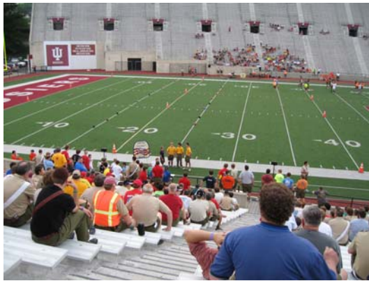
(left) Central Region get together at the National Conservation and Leadership Summit. Central region won the Dodge Ball Contest beating the other three regions.

Chief– Thanks for coming, total of 210 people. Have a great summer.